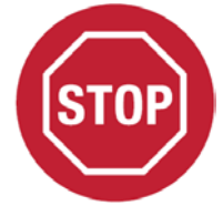
STOP Work Responsibility