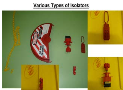
Various types of Isolators

Check Permit-to-work and if Lock Out Tag Out is part of the control measures. Ensure that Red Personal Safety Lock is attached to an Isolator or to a Locking Bar of a Group Isolation Board as per the isolation method used.