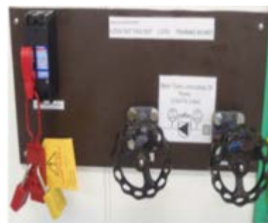
Single Point Isolation