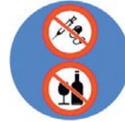
Drug and Alcohol