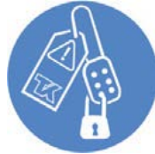
Lock Out Tag Out